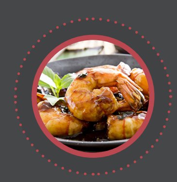
Grilled Teriyaki Prawn with Avocado & Rice Crisps