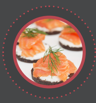
Smoked Salmon & Dill Blini