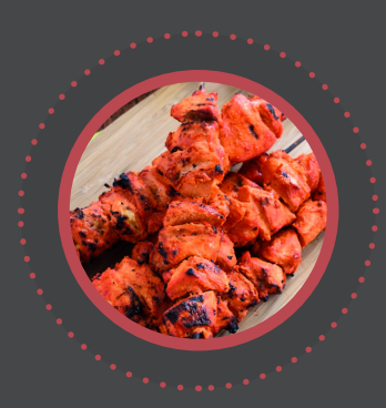
Tandoori chicken skewers with mint yogurt