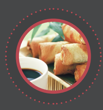
Vegetarian Spring Rolls