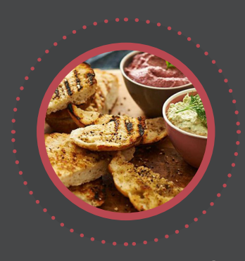
House Dips with Turkish Bread