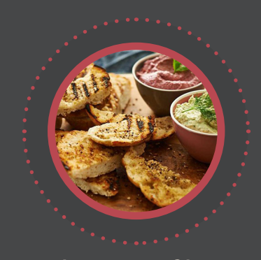
A selection of house made dips & Turkish bread

This package is perfect for some light finger food which will be served over the first two hours of your function.