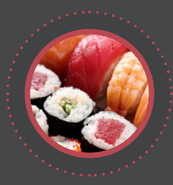
A Selection Of Fresh Sushi