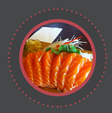
Wild Alaskan salmon sashimi with kombu crust and Japanese plumb